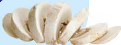
Sliced & Diced